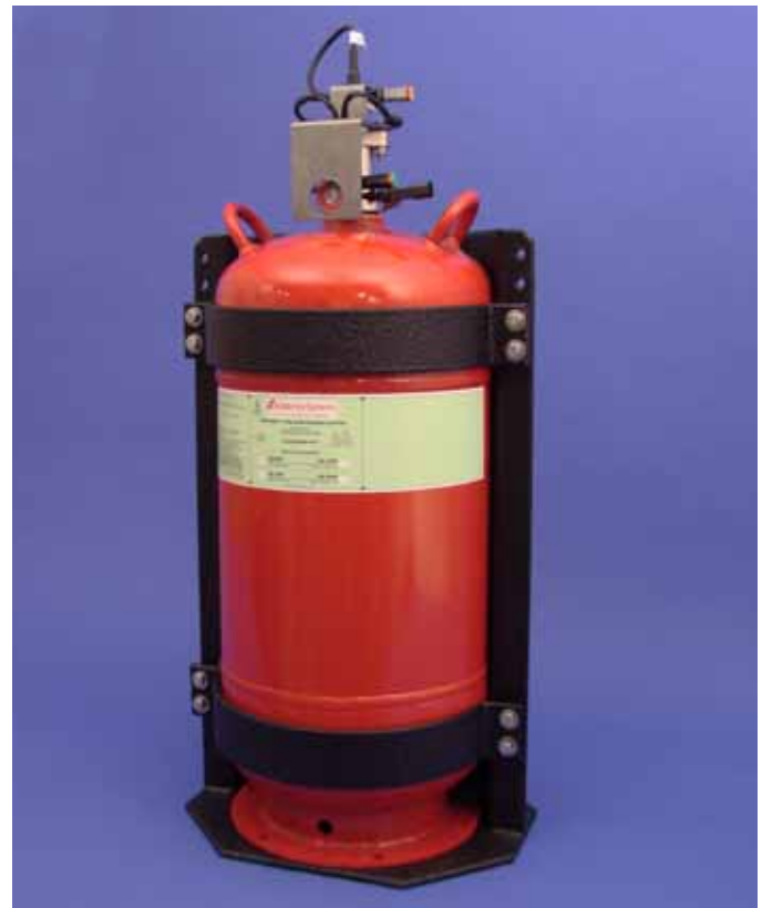
Figure 1. Sentinel LS System

Each cylinder ships with a valve actuator attached. The cylinder can be activated with an electric actuator (protractor device) and/or via pressure. All three actuation ports of the actuator ship with plugs to ensure that water, dirt, and debris do not ingress.